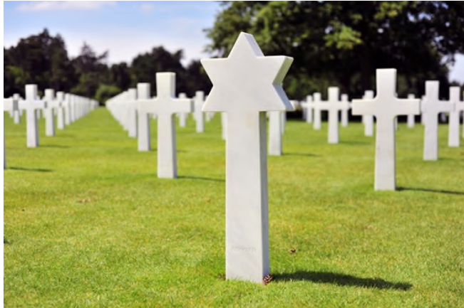
Figure 1—Permanent World War I Grave Markers

That the Latin cross was for a period of time, by default, the burial marker for non-Judeo-Christian soldiers buried abroad does not mean that the military regularly buried non-Christians beneath the Latin cross or that the non-Christians buried beneath the cross recognized the cross as a secular symbol. If the Latin cross were truly secular, then the military would have used it for the Jewish war dead, and that was not the case. Moreover, families of non-Judeo-Christian soldiers could avoid having their loved ones buried beneath the symbol of Christianity by taking advantage of their right to repatriate their loved ones for burial beneath secular markers in domestic cemeteries. Approximately 60-70% of all American soldiers killed during the World Wars were repatriated