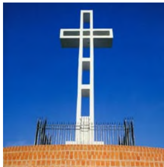
Figure 4—Mt. Soledad Latin cross

The Union's 5th Corps and 6th Corps, respectively, used the Greek cross and the Maltese cross for their insignia (depicted in Figure 5). When these crosses appear in monuments honoring these corps, the crosses have a clear secular meaning: they depict the corps' insignia, invoking these corps' service. At least 34 monuments pay tribute to the 6th Corps with a