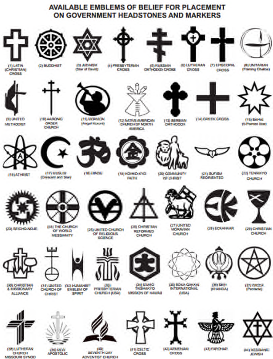
Figure 3—Excerpt of Available Emblems of Belief